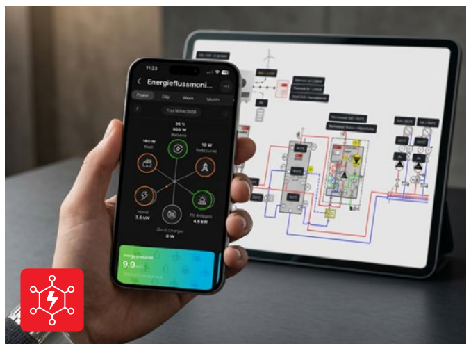
With Hoval Integrate, the Belaria® pro is easy to connect to external home automation and energy management systems.

If you generate your own electricity using photovoltaics, you can use as much as you wish for operating the heat pump, optimising its energy consumption.