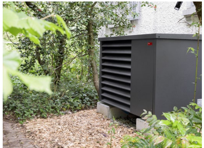
The quiet Belaria® pro solutions are a great choice for both homeowners and the neighbourhood.

Operating the system with electricity from your own photovoltaics, using the open interfaces provided as standard, is an especially economical choice.