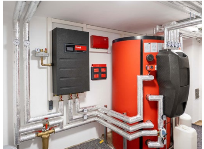
The perfect utility room: Hoval's system solution saves space and can be expanded easily.

A compatible control system and open interfaces make it easy to integrate additional modules.