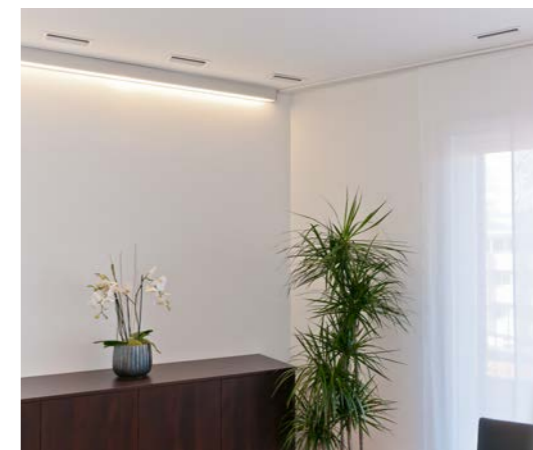
The HomeVent® system offers a wide range of stylish design grilles for supply and extract air. Ask for the brochure "HomeVent® design grilles".

We offer parts that are built to last, a 15-year spare parts warranty and professional customer service around the clock.