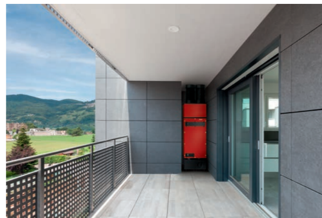
The HomeVent® comfort ventilation units can be installed flexibly, e.g. also outdoors on the balcony.

Whether standing, lying down, suspended or positioned at an angle or horizontally. Indoors or outdoors. Neatly in a cupboard or at an angle under the stairs. HomeVent® adapts to your surroundings and can be integrated discreetly in your home. Even in places with complex requirements.